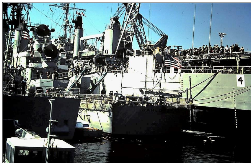
USS Plymouth Rock 1981 in Valparaiso, Chile