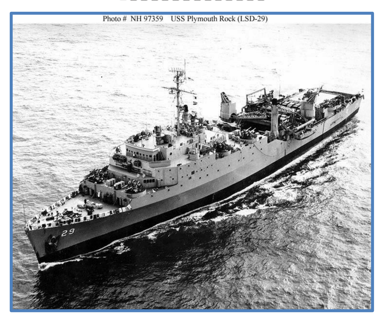
USS Plymouth Rock (LSD-29) photographed circa the later 1950s or early 1960s, with a HUS helicopter parked on her after deck.