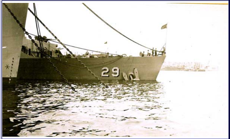
Ballasted down bow, to repair bent screw in Malta, circa 1958