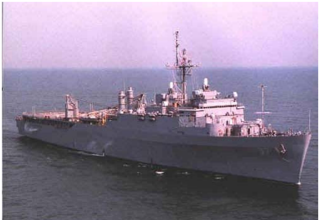
The amphibious dock landing ship USS Portland (LSD 37) will be decommissioned during a ceremony, 10 a.m., Aug. 4 at Naval Amphibious Base, Little Creek, Va.