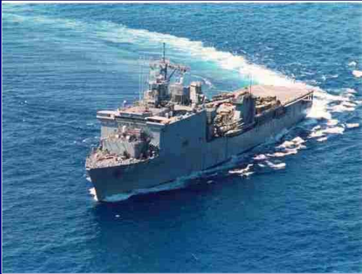
USS Harpers Ferry LSD-49

Harpers Ferry Class Dock Landing Ship: Laid down, 15 April 1991, at Avondale Industries, New Orleans, LA. Launched, 16 January 1993 Commissioned USS Harpers Ferry (LSD-49), 7 January 1995 Harpers Ferry is forward deployed at Sasebo, Japan