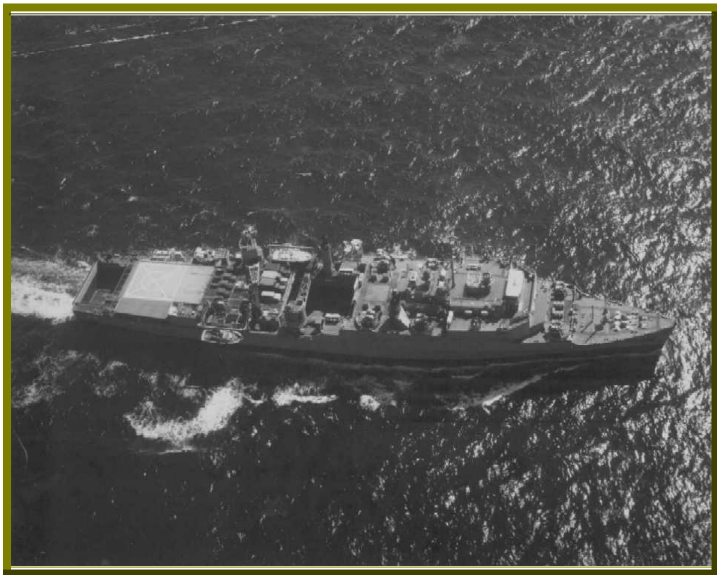
USS Plymouth Rock LSD29, overhead starboard beam, March 17, 1969